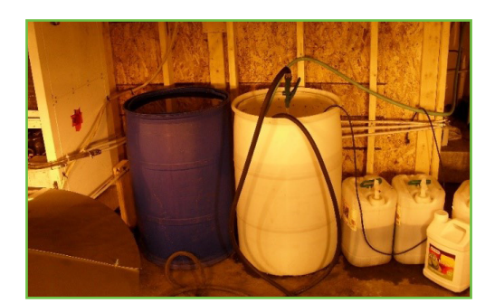
Water drums and chemicals / fertilizers