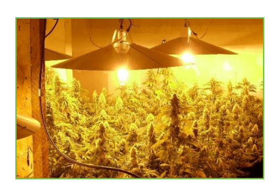
Intensity discharge lamps