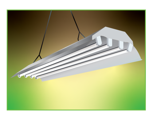
Tesla lights (LED)