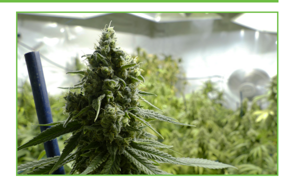
Budding / Flowering