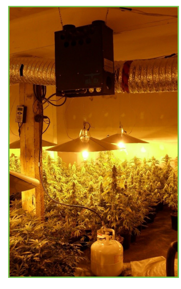
Carbon dioxide burner and propane tanks