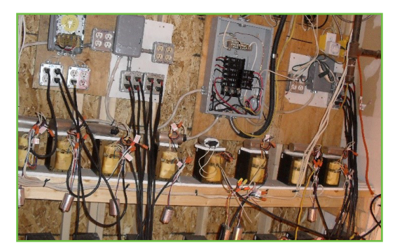
Electrical ballasts, industrial timers, relay switches, fuse panels, loose wiring