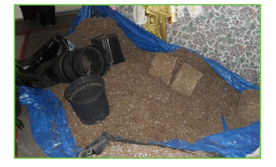
Used plant pots and discarded soil